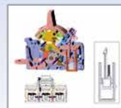
Tripping by Pressure